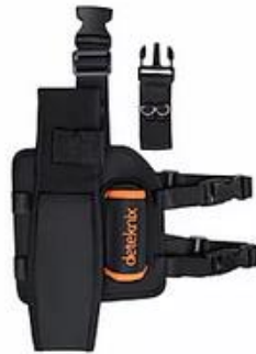
DLP Drop-leg Pouch