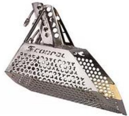
Scoopal® Sand Scoop